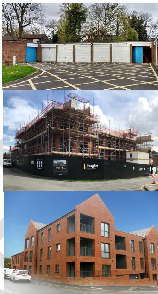
Elmshurst Crescent, before, during and after construction.

In 2015, a rent policy was established for new council homes that are delivered through the development pipeline, whereby rents are to be charged at 65% of market