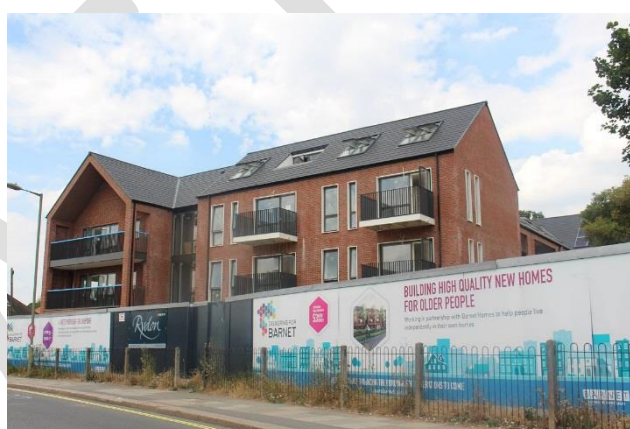
Ansell Court under construction

Barnet Homes has recently completed building a new 53-unit extra care scheme at Ansell Court (formerly Moreton Close NW7). This scheme has been designed with a focus on the needs of people living with dementia to meet the growing need for these services. Sites for two more extra care schemes have been identified and construction on these is expected to start in 2019, providing a further 125 properties.