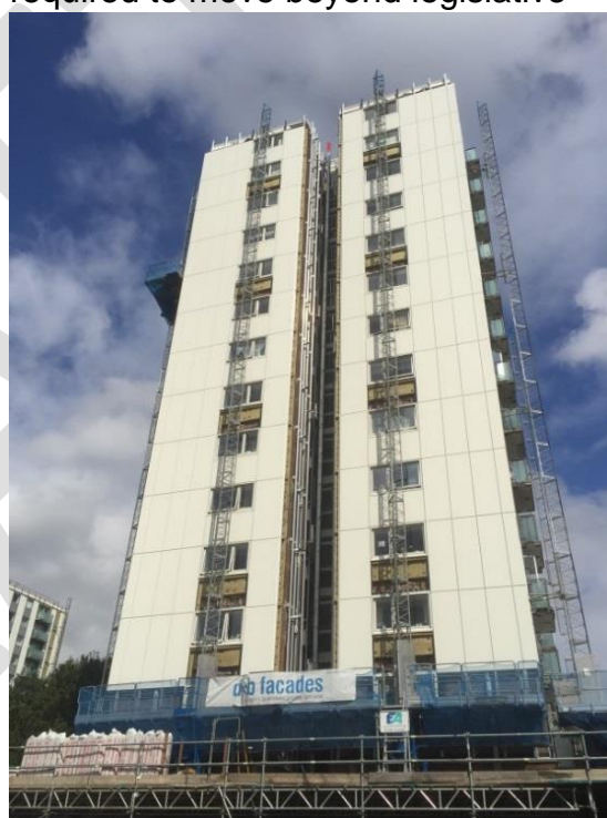
Cladding replacement works underway at Granville Road

Three blocks at Granville Road were identified as having been clad with Aluminium Composite Panels, which failed government fire safety tests. The council moved quickly to remove these panels and a non-combustible replacement cladding has now been fitted.